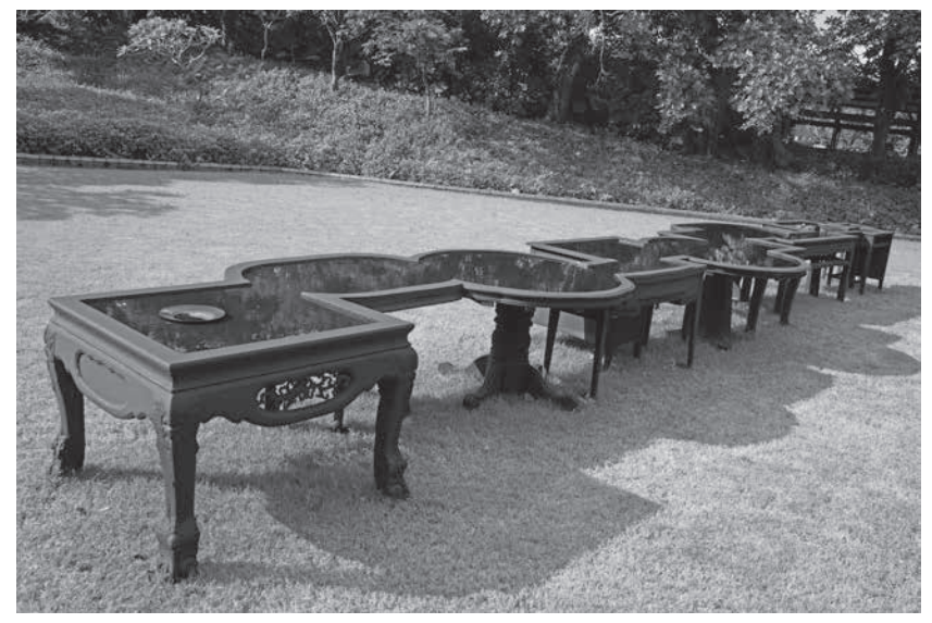
Fig. 3 Zone 7: The Cosmos Energy Picnic Program.