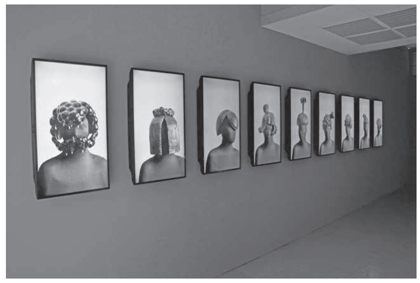
Fig. 5 Zone 6: A Beauty Dining Club.