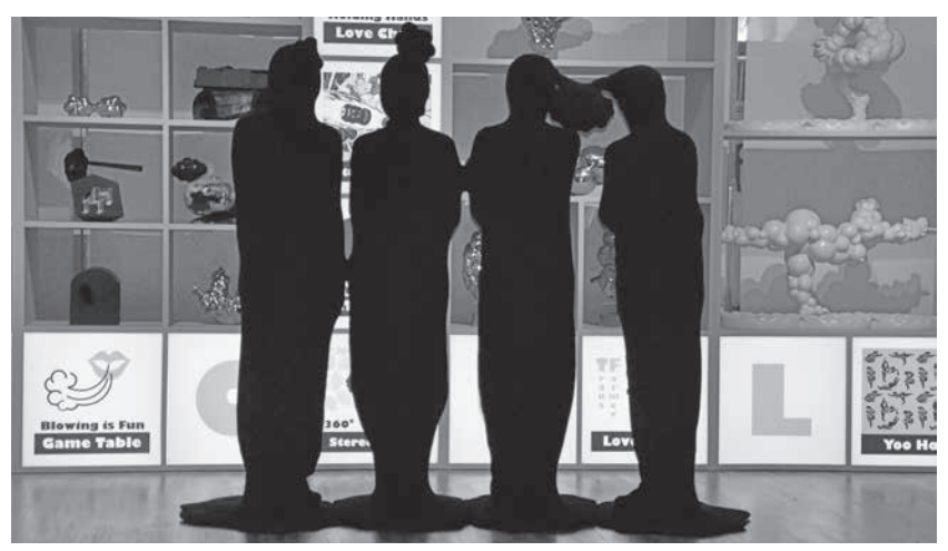
Fig. 4 Zone 7: The Cosmos Energy Picnic Program.